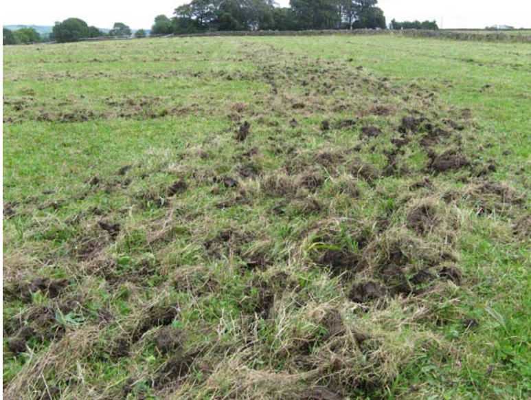
Ground preparation using spring tines

into the schemes. It is sometimes possible to ask them to tine several fields in one go if several schemes are in the same area but there is little point in doing this if the seed is not spread in those fields within the next few days because the sward closes up again. Spring tines are very effective in opening up the surface and the effect can look quite dramatic but it will gradually settle back down again.