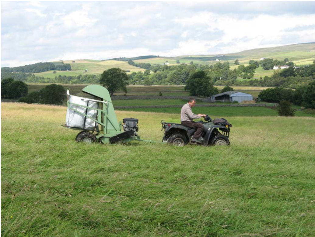
Gathering 'hay concentrate' with the 'top-of-the-hay' harvester

The smaller machines (the 'top-of-the-hay' harvester & spreader) were designed and built by Ian Fletcher, a farmer in North Yorkshire. They are used for cutting and spreading only the top portion of the crop ('hay concentrate'). Both harvester and spreader are towed by quad bike. The small size of these machines means that they can get into awkward places to harvest and spread provided the towing quad bike is sufficiently powerful. A set of plastic teeth at the bottom of the harvester acts as the cutting mechanism. Once the vegetation is cut it is sucked up through the funnel of the machine and blown out into the dumpy bag at the back.