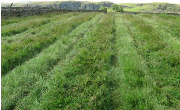
Meadow after harvesting with the 'top-of-the-hay' harvester

14.5 In order to avoid damaging the seed source, it is best wherever possible to harvest in strips, leaving 2 machine widths between each cut strip, rather than harvesting in blocks. Cutting strips all over the field also ensures that a variety of seed from across the field is harvested. However, if it gets late in the season and the farmer is anxious to make his hay, the only option may be to ask him to leave a block of one third uncut. It is usually best to mark out a block in the field with canes and flags or tape and show him which side of the canes to leave uncut.