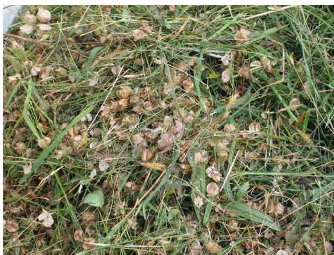
'Hay concentrate' harvested by the 'top-of-the-hay' harvester

14.7 The material harvested by these machines is full of seeds but there is also quite a lot of leafy material. In theory this is an advantage over material harvested by a brush harvester as it gives very small seeds something to stick to and means fewer of them get blown away or knocked off.