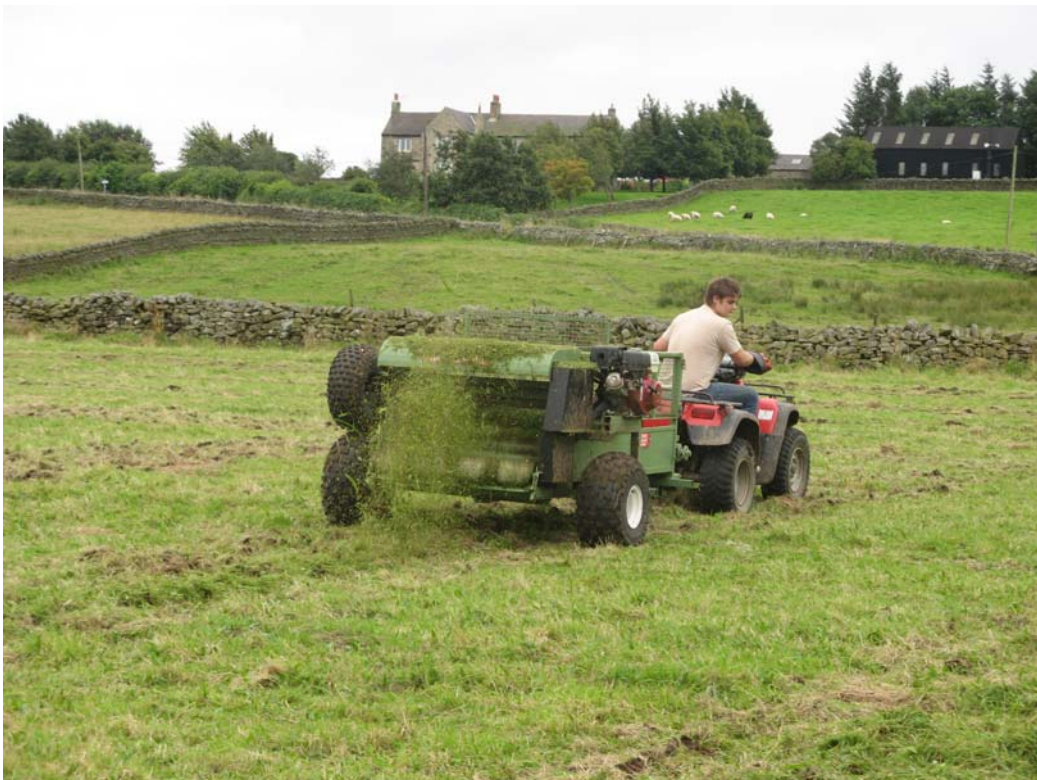
Spreading 'hay concentrate' with the small machine