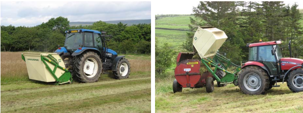
Harvesting with the Amazone mower-collector

14.13 Once the bucket is full (after travelling about 60m) its contents are tipped into a muck spreader. About 6 bucket loads fit into the spreaders used by the Hay Time contractors.