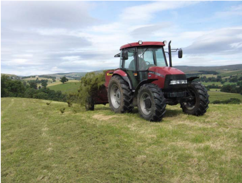
Spreading green hay using a standard muck spreader