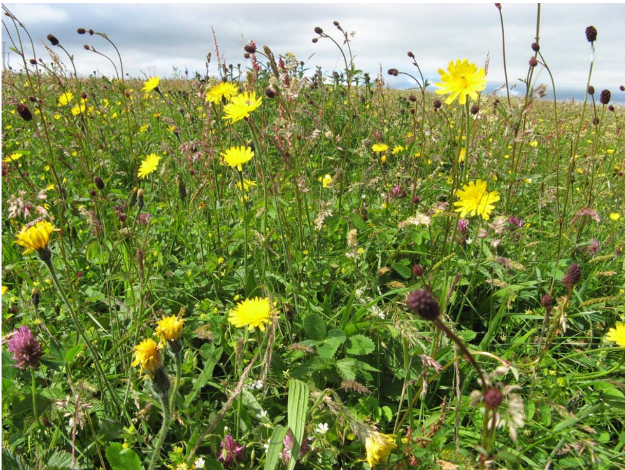
Species-rich upland hay meadow, Weardale

NORTH PENNINES Area of Outstanding Natural Beauty